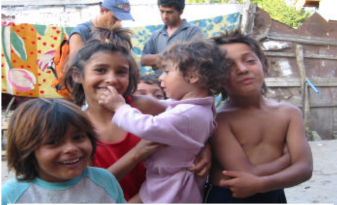
Roma Children at IDP camps in Kosovo