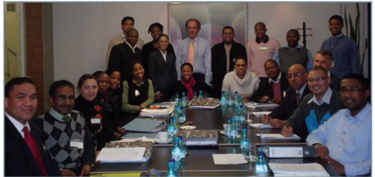
Delegates in the July 2008 CLTP in Cape Town, South Africa

Over the course of the program, ISLP has utilized 15 experienced practitioners from the US, Canada and UK as volunteer instructors-- with many enjoying the experience so much that they have returned multiple times. The ISLP attorneys are joined by South African commercial law attorneys as co-